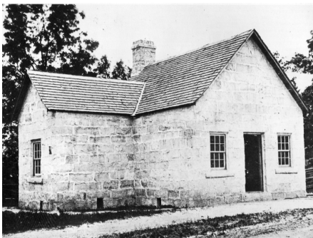
The first city hall and courthouse in Snellville was a small rock building facing Hwy 78 at Pate Street

In the late 1920's the city charter became dormant for a period of approximately twelve years, and again Snellville depended on the county government for assistance with maintaining order.