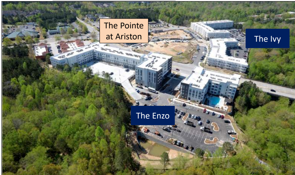
The Pointe at Ariston