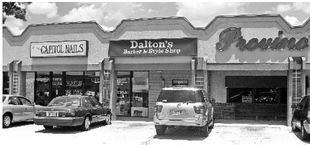
Peanut's current barber shop

It is not known if Peanut was ever a recipient of one of Sam's tickets.