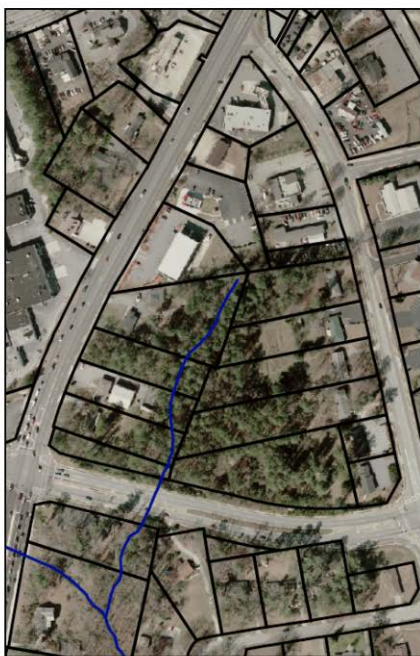
RZ 07-09 – Darren Harper Rezoning

The subject 1.99± acre property is currently vacant and contains a partially constructed 48,000 sq. ft. steel structure, stormwater detention pond and parking lot. The subject property has been through several rezoning and variance hearings within the past 10 years but was originally used for single family residential use. The original 2007 zoning change (case #RZ 07-09) included the properties at 2387 and 2397 Lenora Church Road which were both changed from RS-180 (Single-family Residence) District to OP (Office Professional) District.