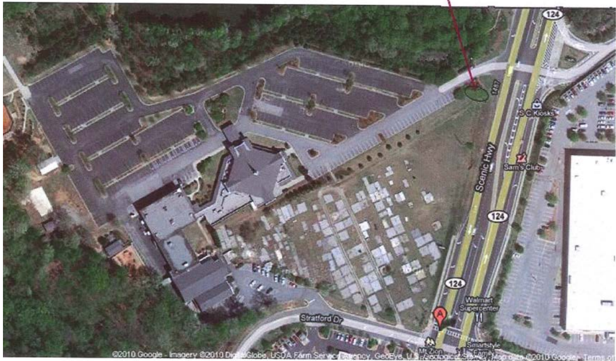
The proposed sign location, submitted by the applicant.