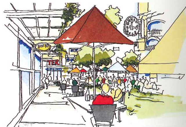
Snellville, Where Everybody’s Proud to be Somebody