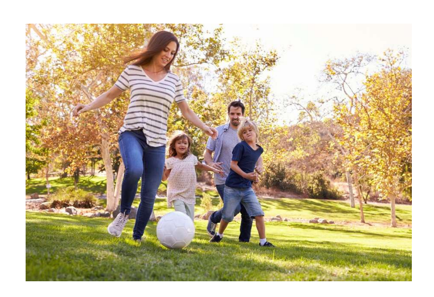
Refer to your Summary Plan Description and Policy Certificate for full details on the plan