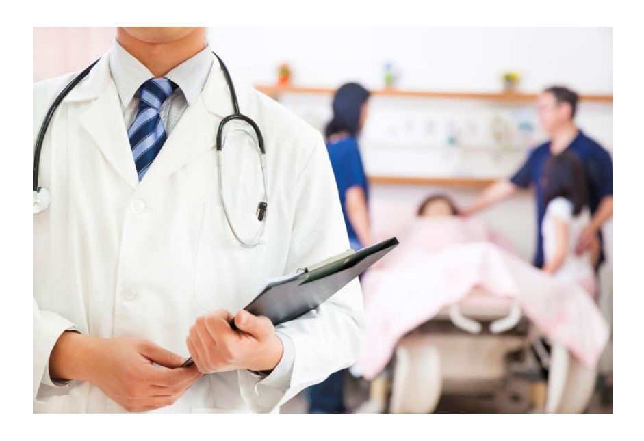
Refer to your Summary Plan Description and Policy Certificate for full details on the plan