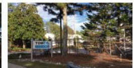
Top left to bottom right: 1 and 2) Existing homes; 3) Summit Chase golf course; 4) Existing home; 5) TOMCO2 Systems